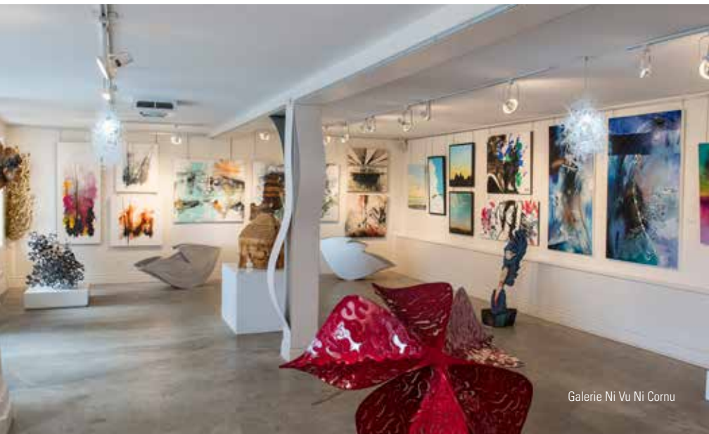
Galerie Ni Vu Ni Cornu