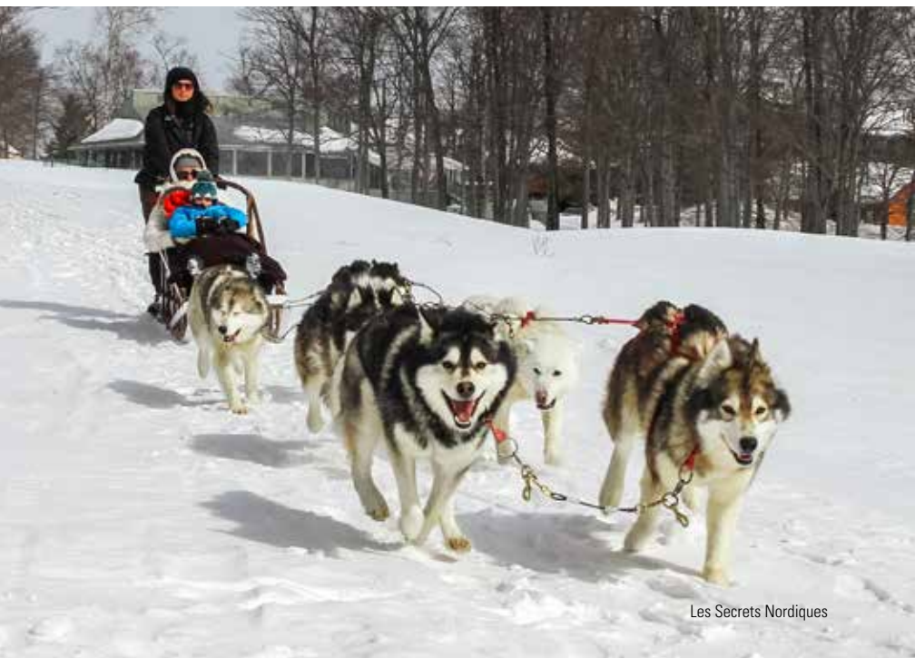
Les Secrets Nordiques

Only 30 minutes from Québec City, Mont-Sainte-Anne is a 4-season activities in a breathtaking setting. The skiable terrain includes 71 trails and 2 snow parks spread across 3 sides of the mountain. After sundown, 19 trails remain floodlit. Enjoy the "boardercross" and alpine hiking. The XC ski center offers 200 km of trails, including 191 km for skating. In summer, discover our XC, DH and Enduro bike and hiking trails at the base and the top of the mountain. Le Grand Vallon golf course offers 18 or 9 holes with a splendid view on the mountain. Hours: open year-round.