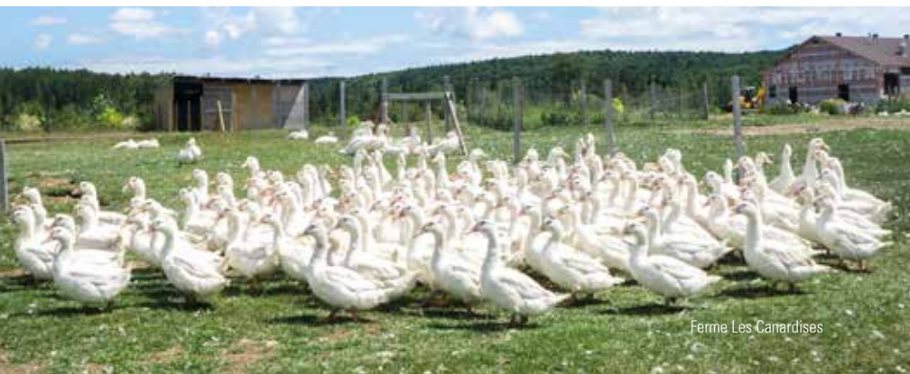
Ferme Les Canardises

Enchanting landscapes will help you to relax!