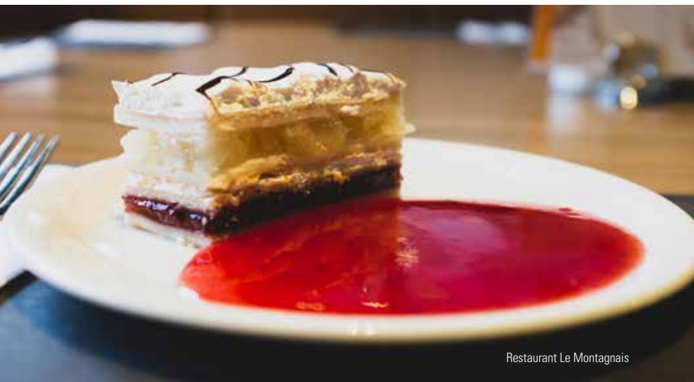
Restaurant Le Montagnais