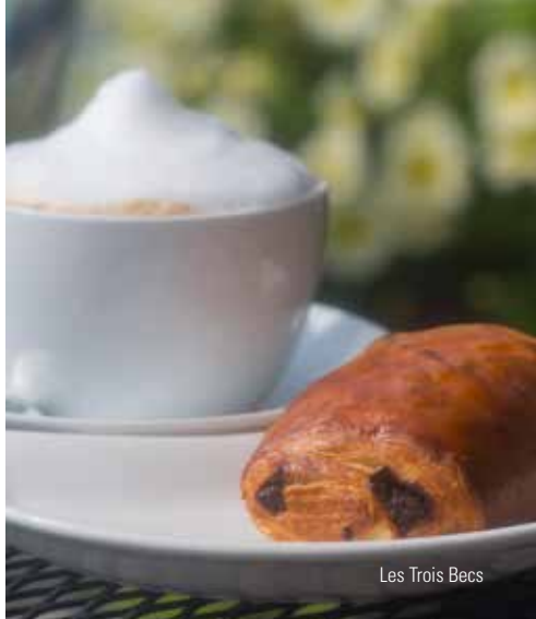
Les Trois Beccs