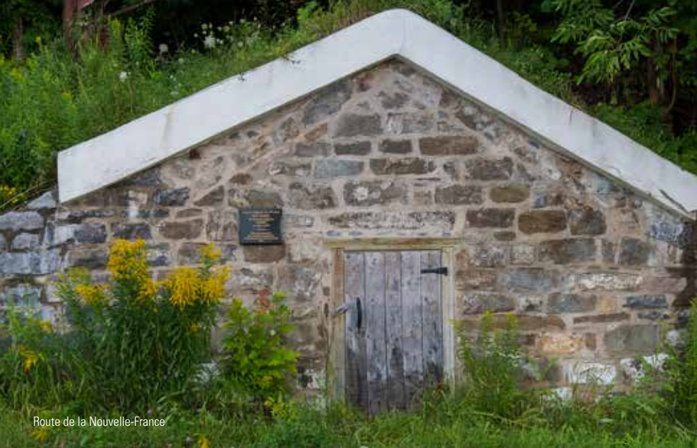
Route de la Nouvelle-France