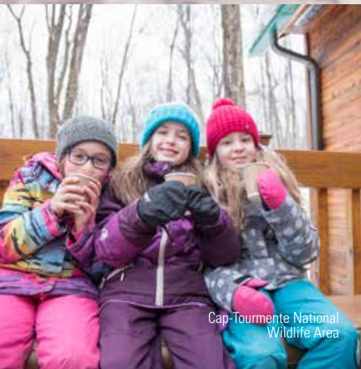
Cap-Tourmente National Wildlife Area