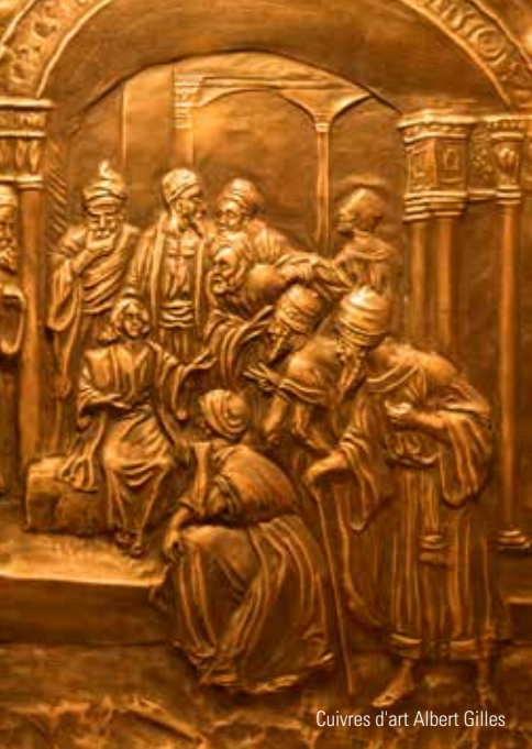
Cuivres d'art Albert Gilles