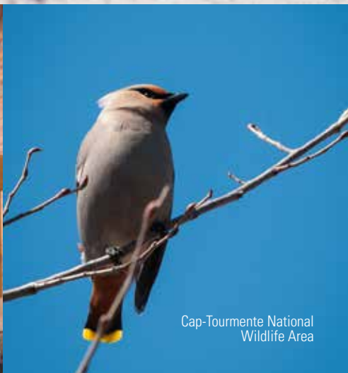
Cap-Tourmente National Wildlife Area